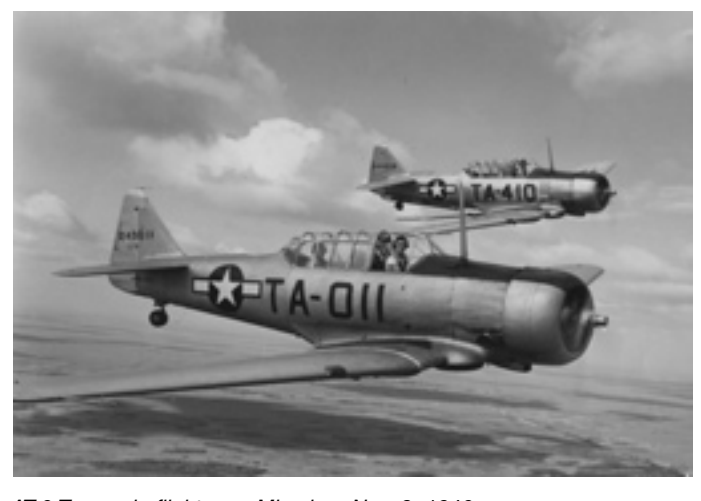
AT-6 Texans in flight over Miami on Nov. 8, 1946.

Nicknamed "Pilot Maker" * repainted models used to depict Japanese Zeros in 1970 film "Tora! Tora! Tora!" * redesignated twice, from BC-1 to AT-6 (1940) and from AT-6 to T-6 (1948) * Last T-6 used by an air force (South African AF) retired in 1996 * France called its T-6s "Tomcats" * C model built partly of plywood (to conserve materials) * used as combat aircraft in conflicts in Latin America, Africa, Mideast, Southeast Asia.